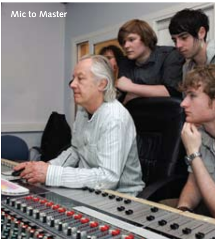
Mic to Master