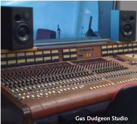
Gus Dudgeon Studio